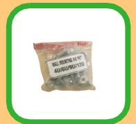
Assembly Hardware (m6 screw and nut)