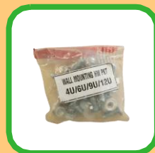
Equipment Mounting Hardware (4u screws & nuts)