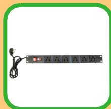
Power Distribution Unit