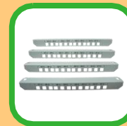
19" Mounting Rails