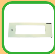
Front Glass Door